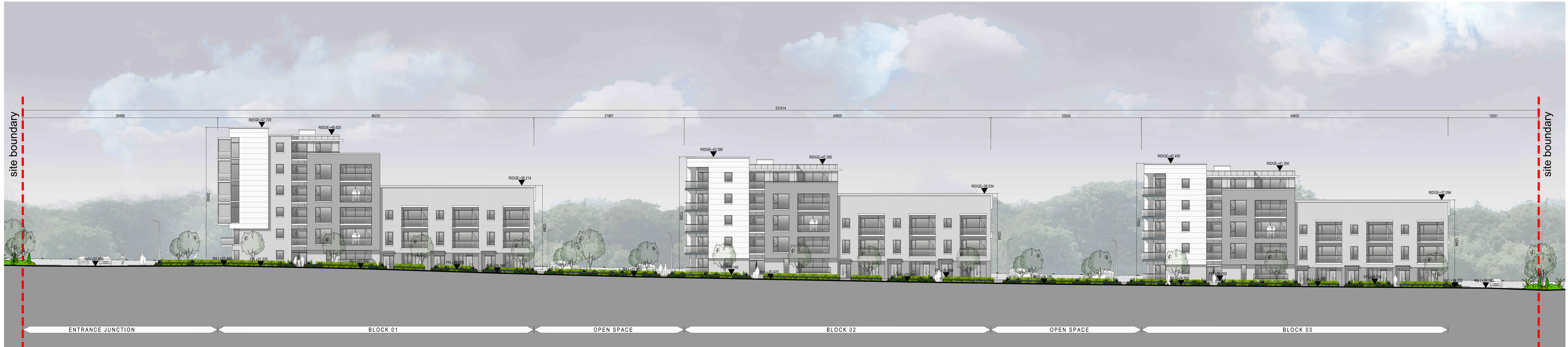
Context Elevation H-H Scale 1:200