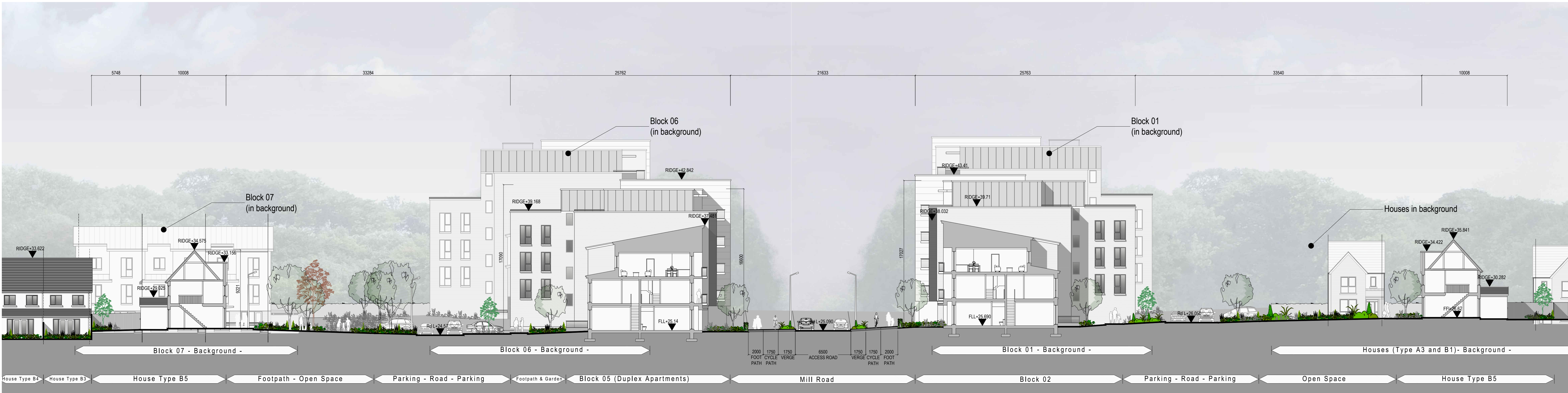
Context Section I-I Scale 1:200